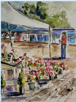
Rosi Roth's sketch book