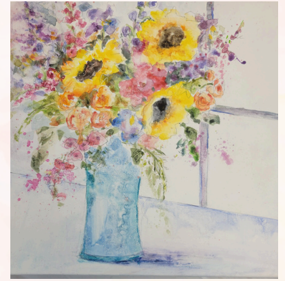
Rosi Roth's finished painting